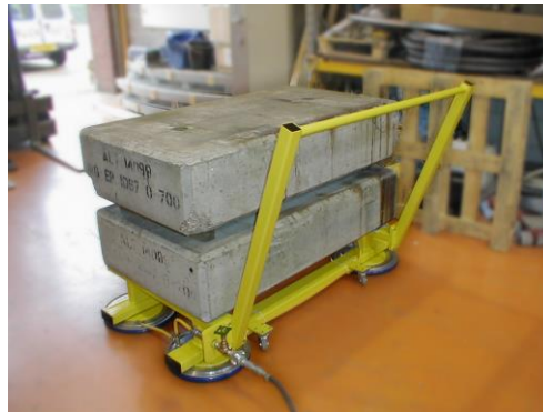
A simple 1,600kg capacity platform with four LA12 bearings