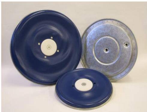
There are three sizes of Hovair LA bearings available

Optional accessories include remote control boxes with 'dead-man' on/off trigger and quick exhaust, LA spacer blocks, allowing the bearing to be mounted underneath a flat face without the air inlet being obstructed. There are also quick-release hoses and fittings for when speed of fitting is important.